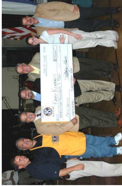
Shown here is Patchogue Kiwanis presenting a check for $35,000 to build a housing cabin at Kamp Kiwanis in Taberg, New York. Annually, the club also sponsors campers from our service area.